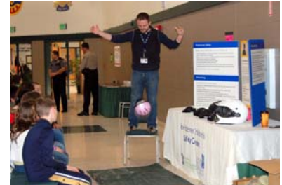
A Doernbecher bicycle helmet demonstration at the Safety Fun Fair.

More than 845 children were impacted by the group’s outreach, which in turn reached out to their families and friends, effectively touching thousands of lives.