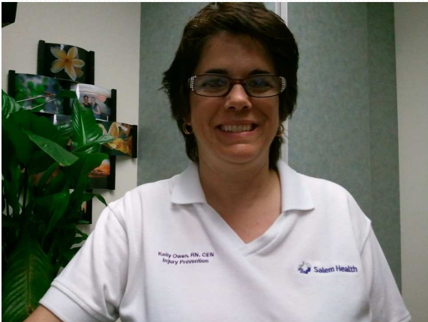
Injury Prevention Coordinator at Salem Hospital