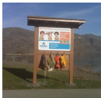
The Life Jacket Loaner Kiosk at Mayer State Park

Safe Kids Columbia Gorge has recently placed a free Life Jacket Loaner Kiosk at Mayer State Park. To promote safe practices in and around water, they would like to encourage you to borrow a life jacket and WEAR IT! This spring, borrow a life jacket when you are recreating on the Columbia River and return it to the kiosk for others to use.