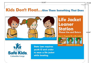
A Columbia Gorge PFD loaner station sign