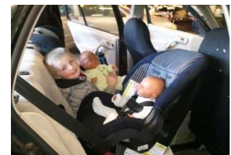
A proud older brother of a new baby sister at a SK Willamette Valley car seat clinic.

Safe Kids Willamette Valley , in partnership with Salem Hospital, holds monthly car seat clinics throughout Marion and Polk counties. They are the primary distribution source of reduced cost car seats to qualifying low income families in the area.