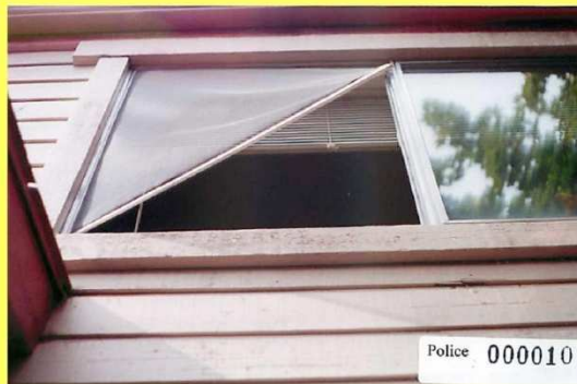
Two-story apartment in Roseburg, Oregon.