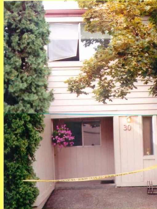
Window safety is not just an urban, high rise concern.