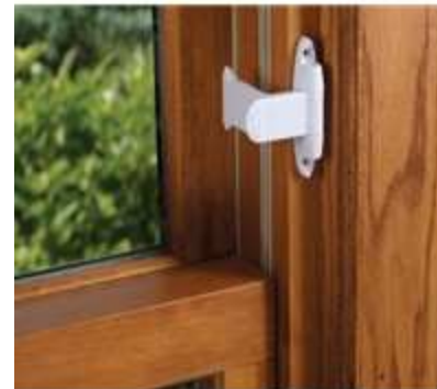
KidCo - Window Stop