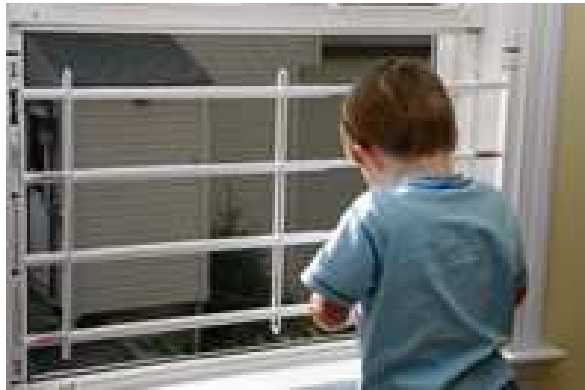
Guardian Angel - Window Guard