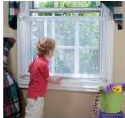
KidCo Mesh – Window Guard